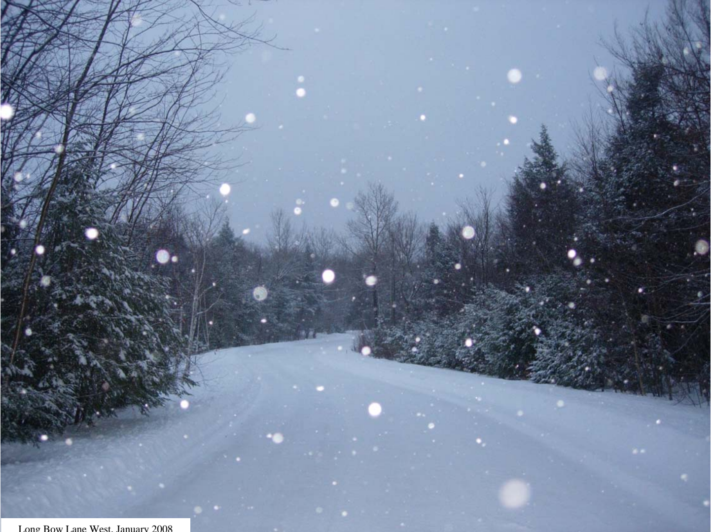
Long Bow Lane West, January 2008