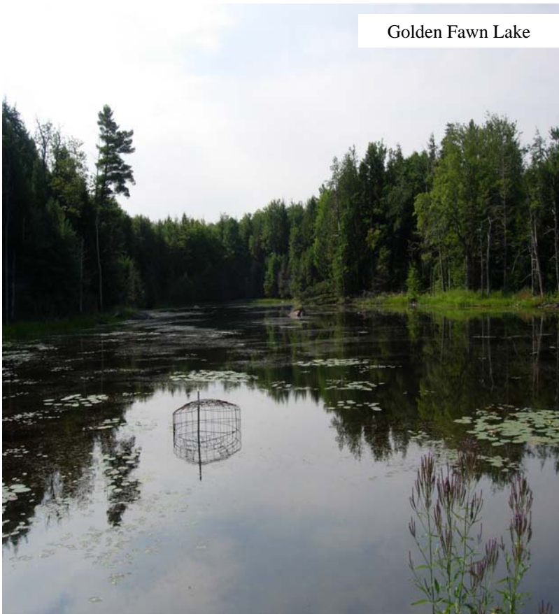
Golden Fawn Lake