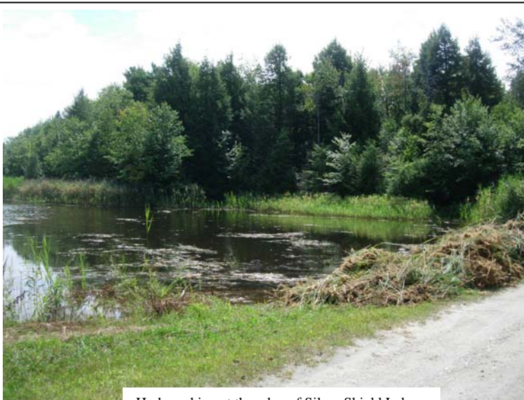
Hydro-raking at the edge of Silver Shield Lake.