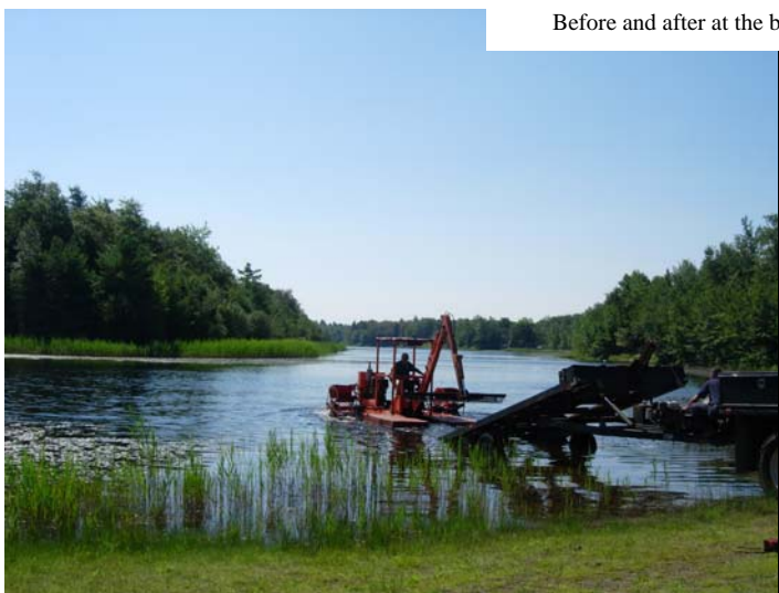
Before and after at the beach on Longbow Lake