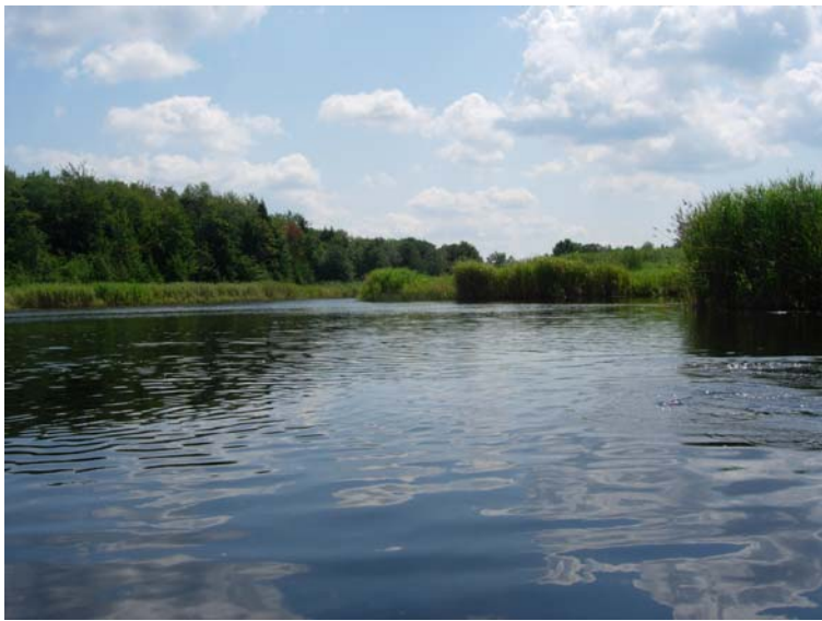
Silver Shield Lake after Sonar Herbicide treatment, August 2008

As a result of limited funds due to the severe December 2008 ice storm, the February 2009 winter phragmite mowing was cancelled. The Committee is looking into a possible chemical treatment of shoreline phragmites on Longbow and Silver Shield Lakes during the summer of 2009.