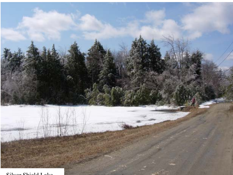
Silver Shield Lake