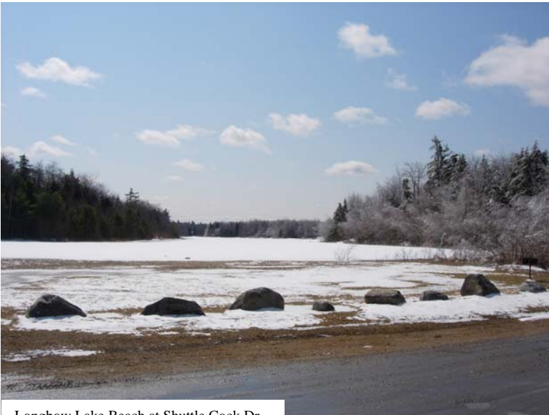
Longbow Lake Beach at Shuttle Cock Dr.