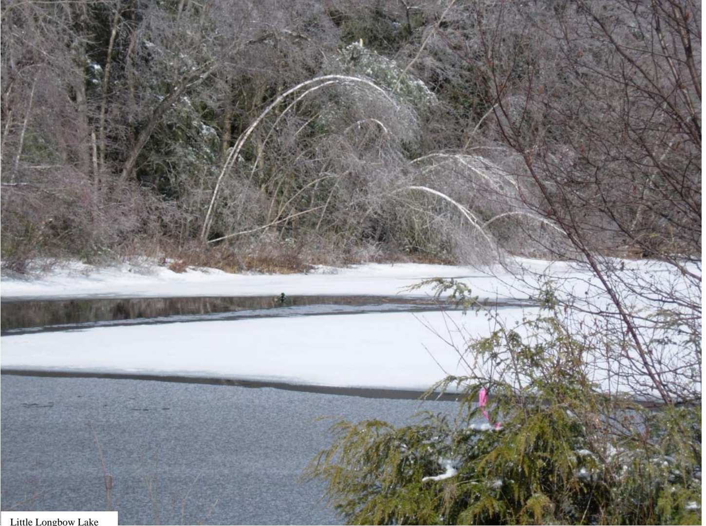
Little Longbow Lake