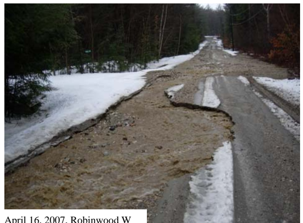
April 16, 2007, Robinwood W